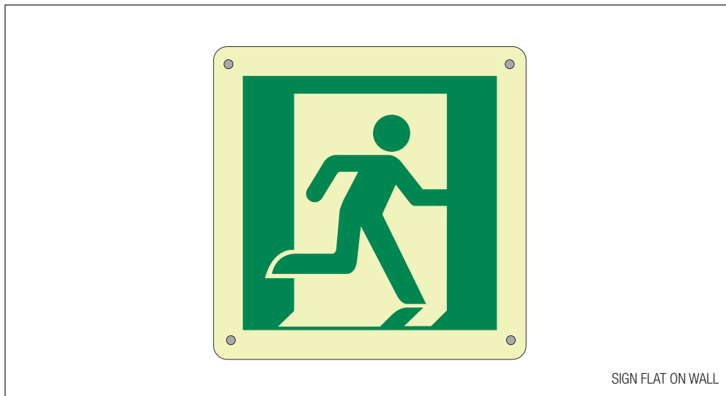
SIGN FLAT ON WALL