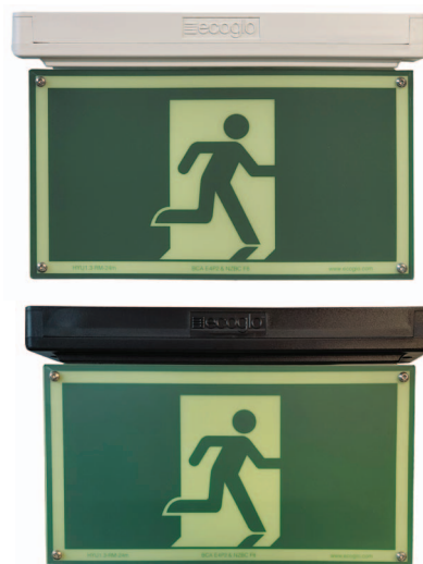
Ceiling and wall mountable without additional accessories

The HYUx.3 is a hybrid PL exit sign with a viewing distance of 24 metres.