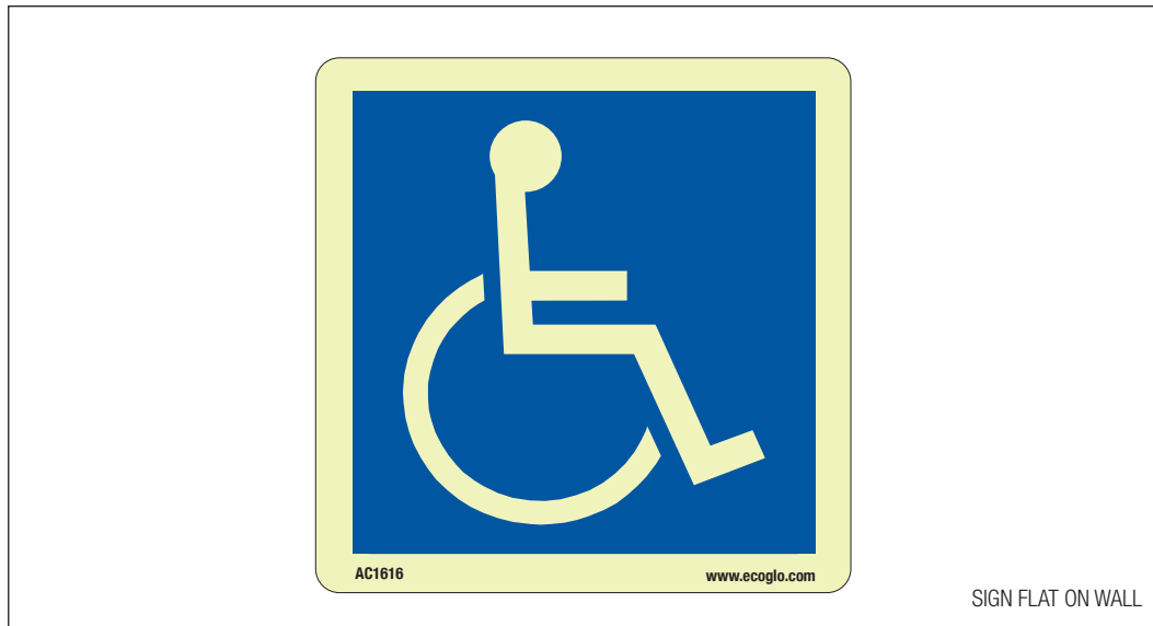
SIGN FLAT ON WALL